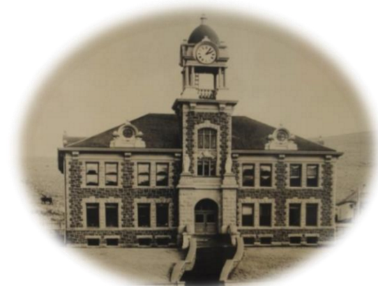
Morrow County Courthouse - Heppner, Oregon

Discover Heppner's eventful history by following the route of